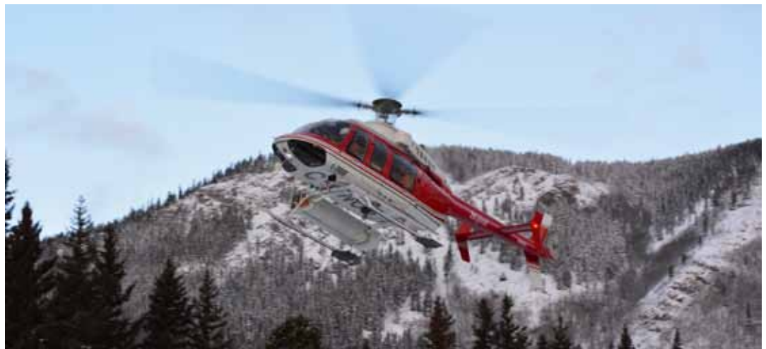
Alpine Helicopter out of Canmore

survey, please sign into D4H and ensure that your contact information is up to date. The results of the Membership Survey will be presented at the General Members Meeting on March 27, 2014. We hope to see you all in attendance.